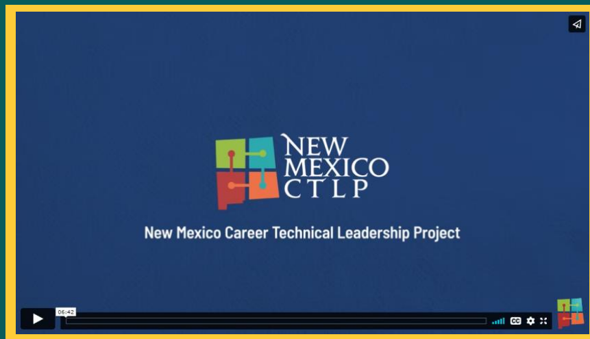
New Mexico CTSO Video

We all know that students who are involved in extracurricular activities/organizations gain skills that help them in the future. Career and Technical Student Organizations (CTSOs) go beyond “clubs” to form an integral part of CTE programs of study, and are extremely effective at promoting career, leadership, and employability skills. Examples of CTOS in NM include DECA, FFA, and SkillsUSA. Check out this new and dynamic promotional video that you can post to your website, send in a parent newsletter, or show in an advisory to get students involved at school.